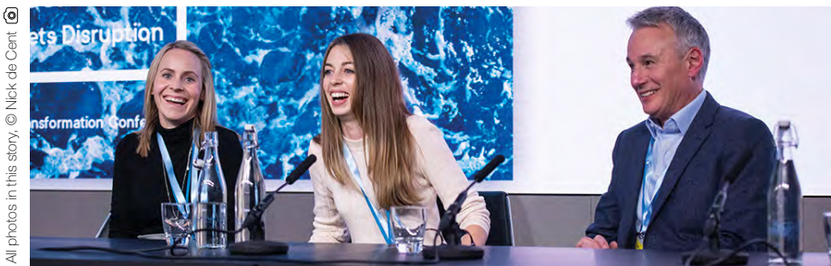
All photos in this story. © Nick de Cent